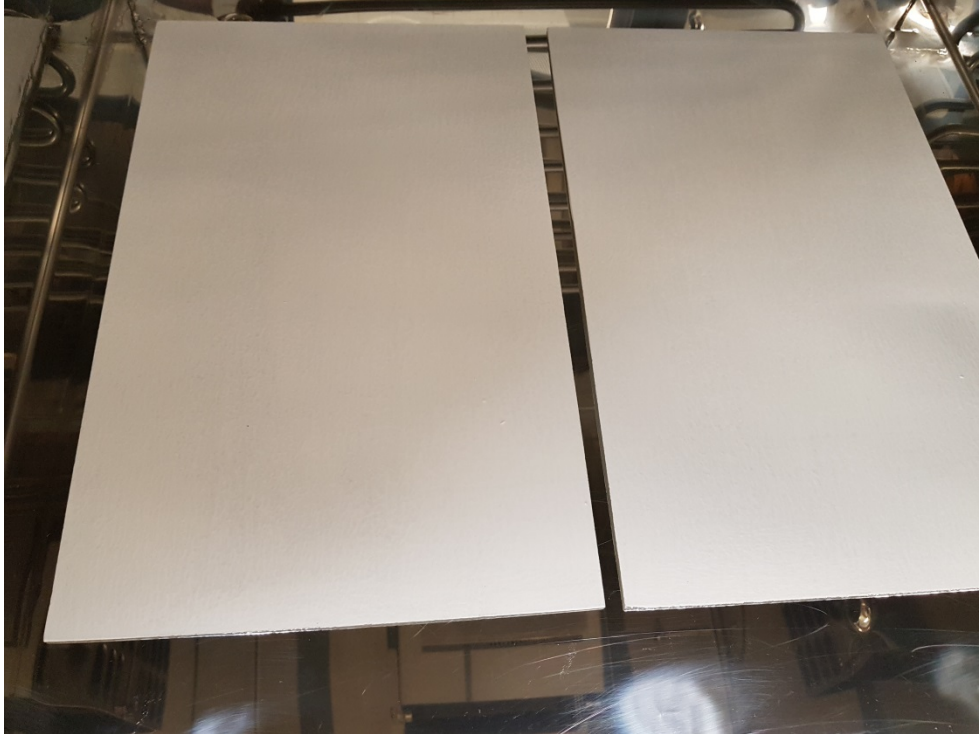
Photo of the test specimens